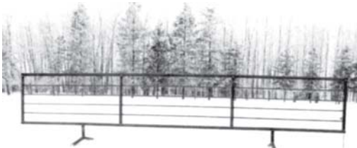
FREE STANDING PANELS